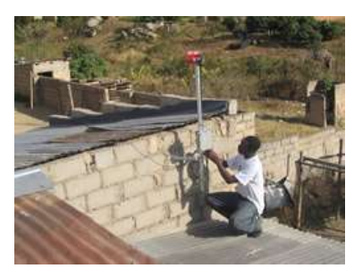
Figure 3 Community members are used to install the Cantennas. The Cantennas will connect rural areas like these to the world.

Figure 2 A view inside the homemade antenna. Note the radiating element.