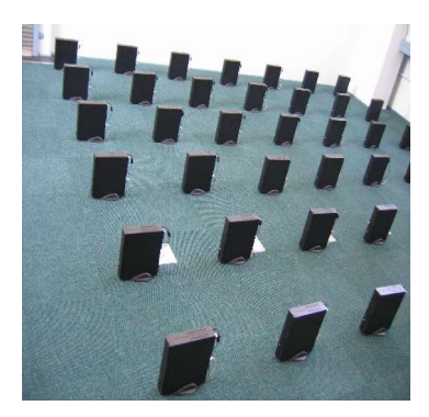
Figure 1 Laboratory test-bed

[1] "How To Build A Tin Can Waveguide WiFi Antenna", accessed 22 August 2005, URL: <u>http://www.turnpoint.net/wireless/cantennahowto.html</u>