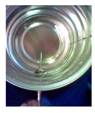
Figure 2 A view inside the homemade antenna. Note the radiating element.